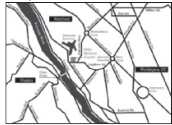
On-site parking is available. The fee is currently $11.00 for the day.

5255 Loughboro Rd. NW. Washington, D.C. 20016